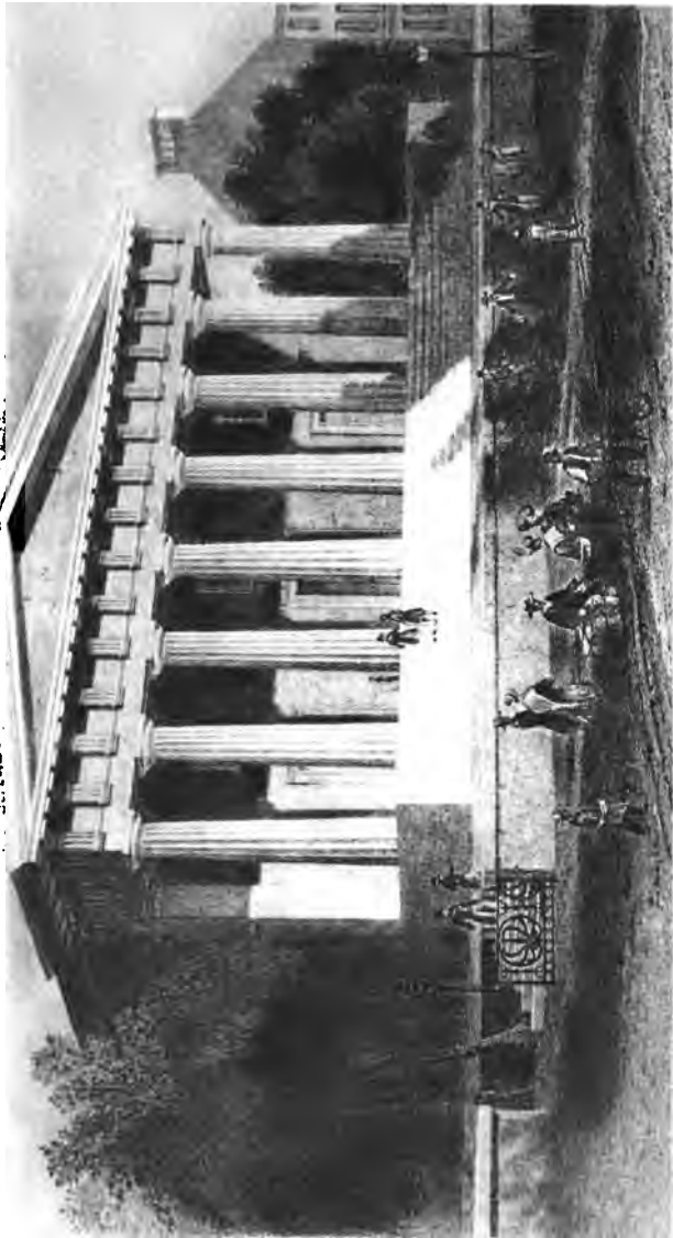
Gravure Anversse-Lamb, Co. N. Y.